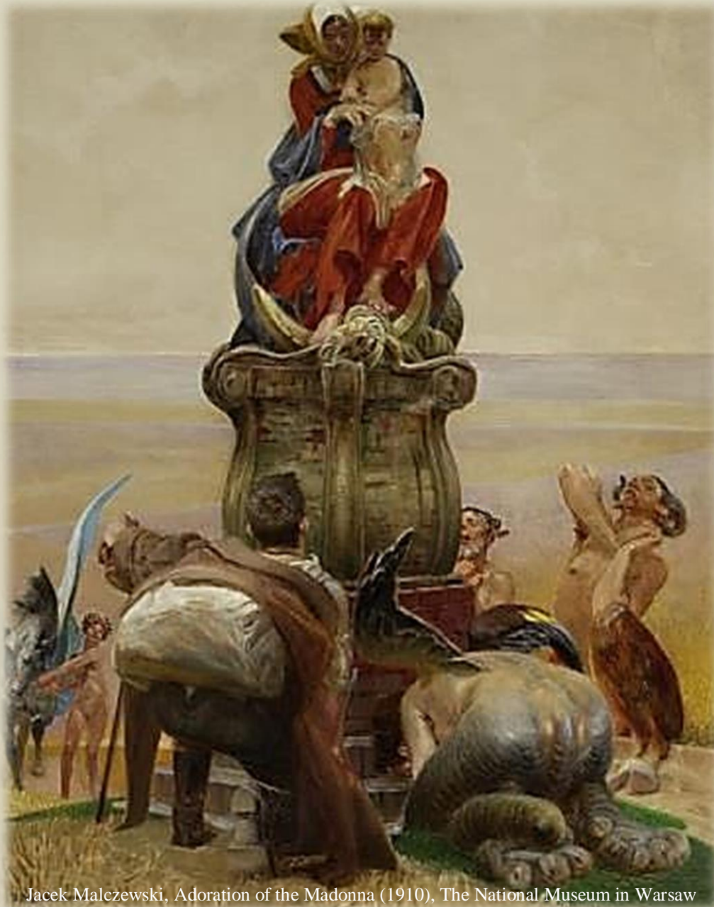
Jacek Malczewski, Adoration of the Madonna (1910), The National Museum in Warsaw

NONNUS OF PANOPOLIS IN CONTEXT III: OLD QUESTIONS AND NEW PERSPECTIVES